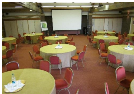
Conference Centre – Cabaret Style