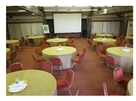
Conference Centre - Cabaret Style